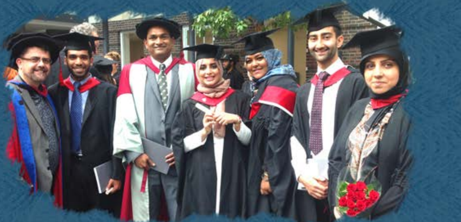
Graduation Ceremony at Middlesex University.